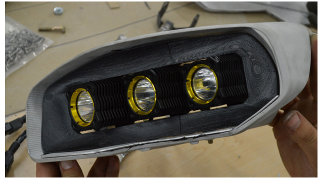
Assembling and testing customized 3D printed Ford Fiesta ST headlights.