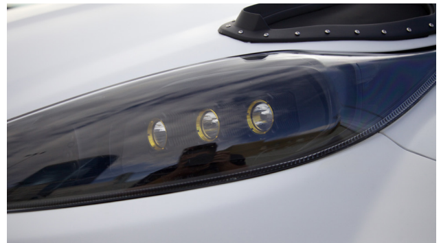
With 3D printing, Tucci can make many more custom parts per project than is possible using traditional model making methods.